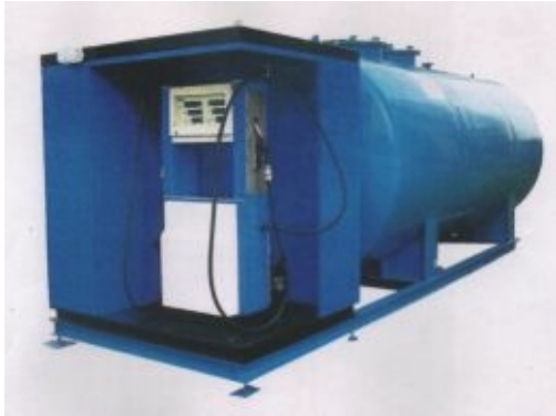
pic. 1 Container liquid fuel station