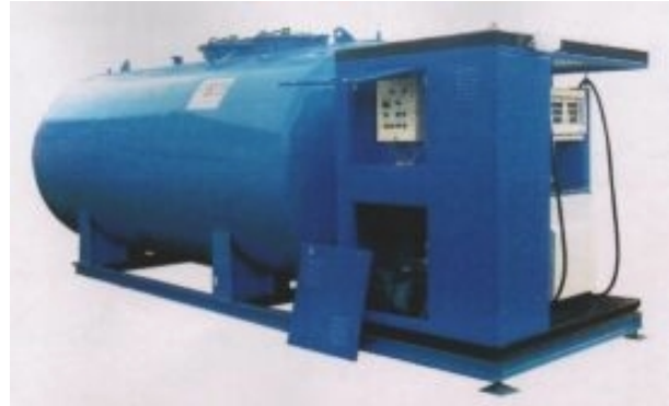
pic. 2 Container liquid fuel station